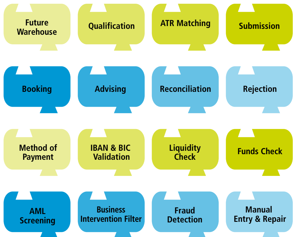
Workflow stages for UK Faster Payments. You define the workflow.

The secure, web-based front-end allows local and remote payment entry and repair, liquidity management, and comprehensive exception management. The system fully supports ISO 20022 messaging ensuring no truncation of data. It is component based and built on modern open standards and technology giving you the greatest flexibility in choice of hardware and technology platform.